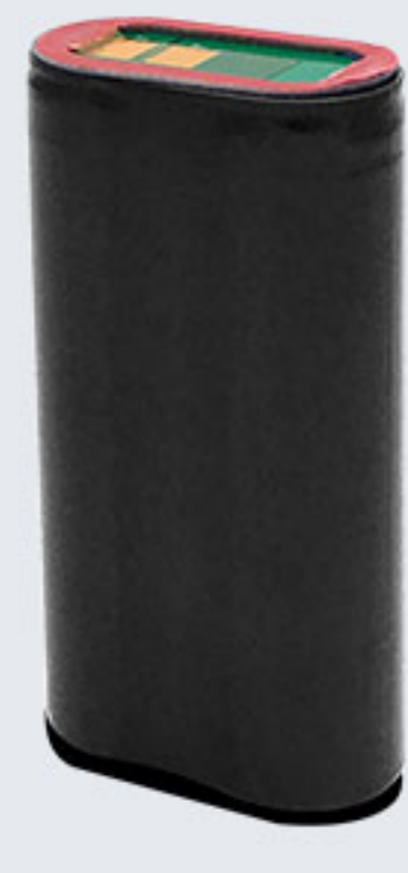
BTY-C61-PB Pistol battery, 5,200 mAh