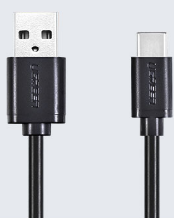
DC-BK-TypeC 1.0 meter Type-C cable