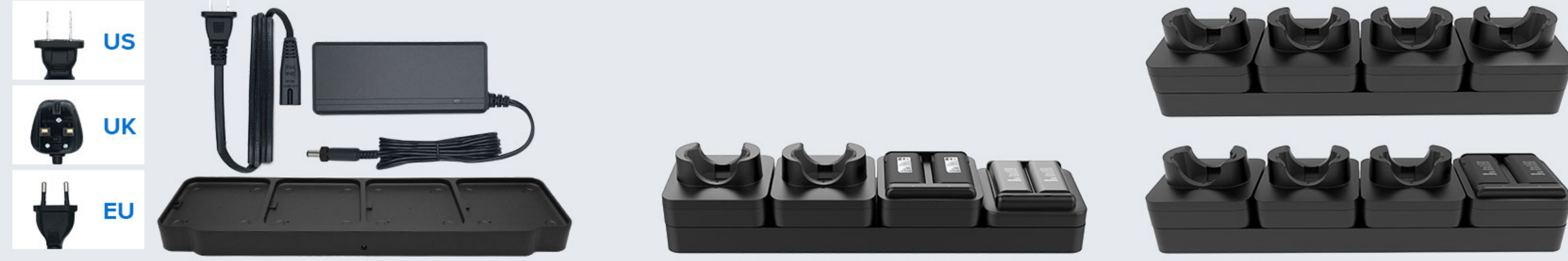
CRD-MCB The base of 4-slots charging cradle set for 4 pieces of cradle, use with DCPWR-12V5A-XX adapter. For load balance, recommendation: 1. 4x cradle for device 2. 3x cradle for device + 1x cradle for main battery 3. 2x cradle for device + 1x cradle for main battery + 1x cradle for pistol battery