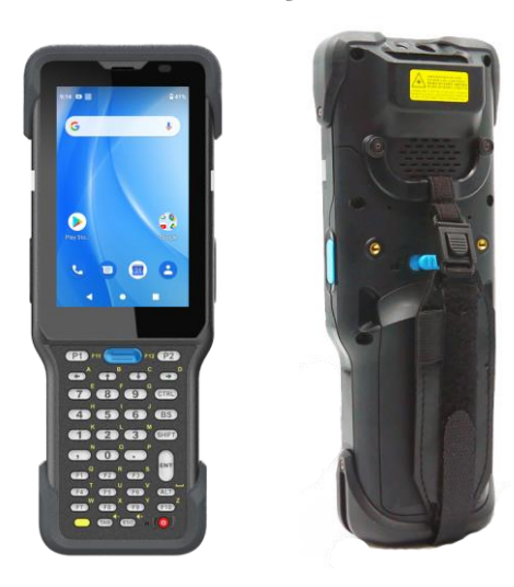
Quick Start Guide