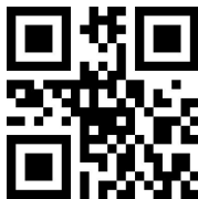
Image Mirror Flip_ON

When there is mirror flip in image, you can boot the mirror flip mode by reading the following programming barcodes.