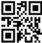
Enable Transmission of RSS-Expanded Parity Bits