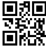
**Fill Light - ON when Photographing

☞ Fill Light - always OFF : the fill light does not light up in any cases.