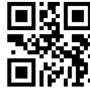
Enhancement of literacy enable