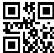
Mexico (Latin America)