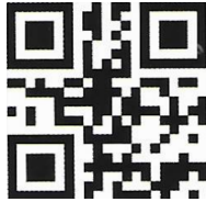
Restore Factory Defaults

After reading this programming barcode, the current parameter setting will be lost and the factory default value will be restored. Factory default parameters and functions can be found in Appendix C.