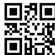
Fill Light - always OFF