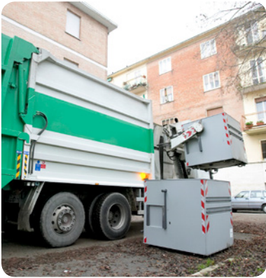
HID can create a custom tag solution to fit your application requirements for chip type, dimensions, programming and materials.