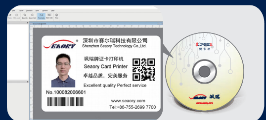
Professional printing software come with the printer