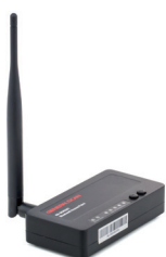
Bluetooth Dongle GS GDA201