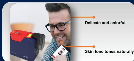
High quality photo processing by Dye sublimation technology

Dual interface card encoding module Contactless ID Card encoding module UHF chip card encoding module Magnetic stripe card encoding module