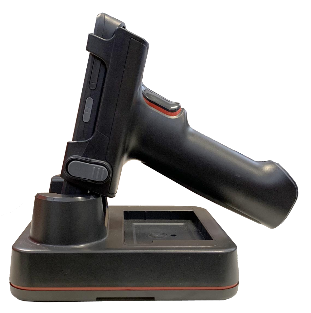
EDA51 with Scan Handle Installed on Home Base