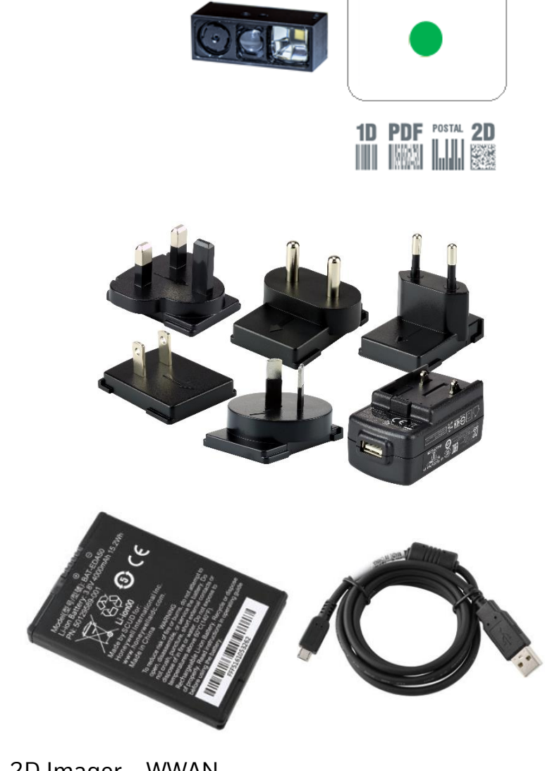
EDA51 – N6603 2D Imager – WWAN