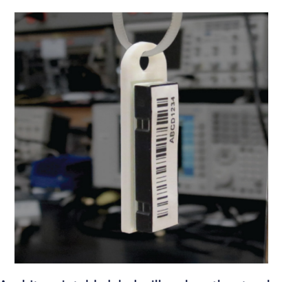
A white printable label will replace the standard black label when a printable label is required.

Omni-ID office locations: US | UK | China | India | Germany For product or technology inquiries email: sales@omni-id.com