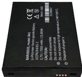
ALX-542 (one included in base SKU)