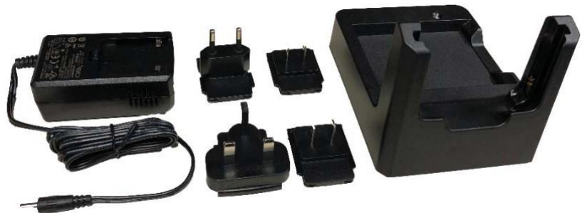
ALX-540 International PSU and Dock (included in base SKU)