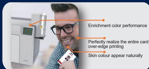
Dye-sublimation transfer printing technology

Alarm for no card, defective card slot Manual feeding card on back end and recycling pending card Available to set the direction of output card